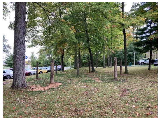
Maple Hall Hammock Garden