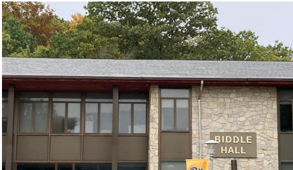
New Biddle Hall Roofing

A. Replacement of the Biddle Hall roof and soffit/fascia. This project will be completed early in the fall 2024 semester. A summer-long delay in obtaining materials caused this project to not be completed during the summer months as planned.