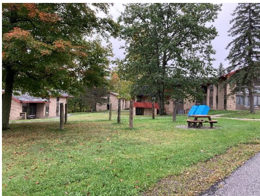
North Lodge Hammock Garden