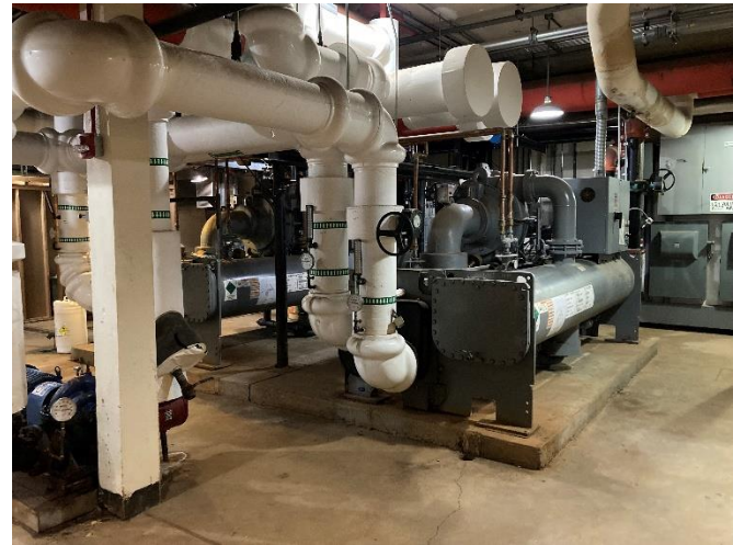
Biddle Hall Cooling Tower and Chiller Plant