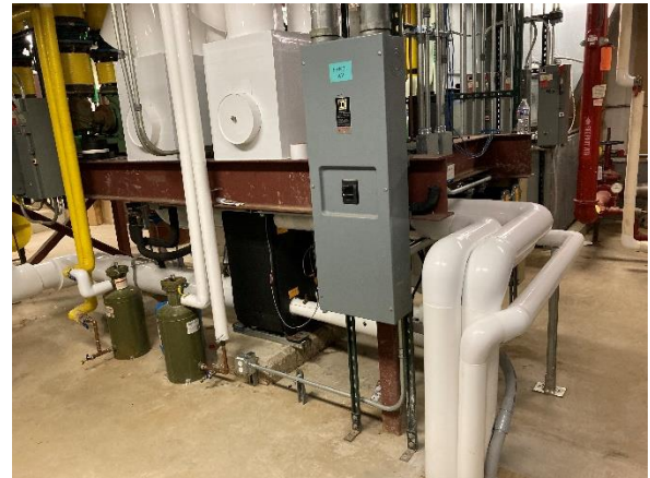
Blackington Hall Chiller